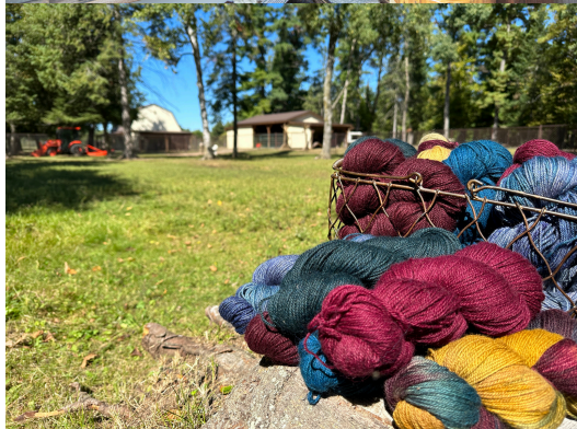
Top 2: Shearing day Middle: Knitwear Bottom: Dyed yarn

Alpacas have some unique characteristics. They do spit, but usually over food and not often at people. They use “communal dung piles” and have one waste area in each pasture making daily clean up easy. A male will “orgle” (a throaty vocalization) in the ear of the female he is courting and breedings are often successful on the first attempt. Farmers know that the female is pregnant because she will “spit” at the male if he tries to approach her. Alpacas “hum” when distressed or worried and produce a staccato “alarm call” to alert the herd to anything questionable on the horizon.