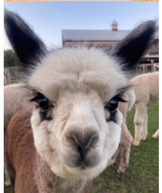
Top: Alpacas in the winter