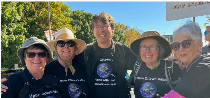
District 21 and other representatives of the Kitchissippi Ottawa Valley chapter of the Council of Canadians in Ottawa on Sept. 20.