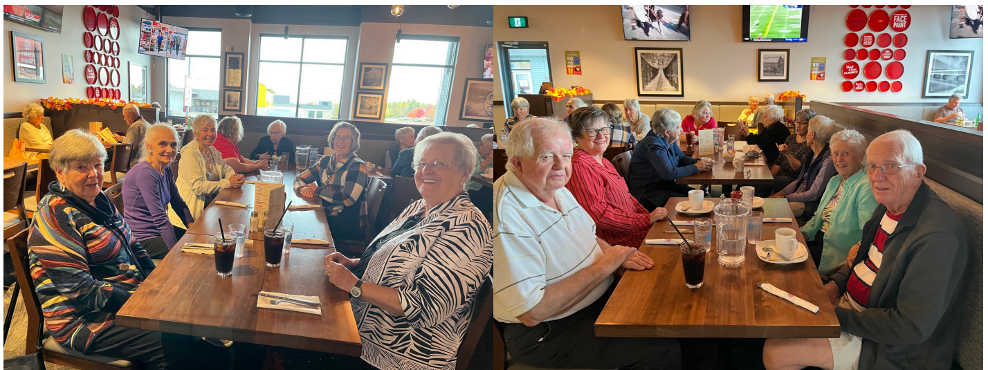
Members of District 21 enjoying lunch at Boston Pizza on October 7th.